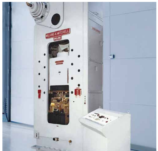
Modernization of Wilkins & Mitchell press.

Test rigs for power press clutch & brake testing are set up in our workshop ready to receive customers' clutch & brake units for insurance testing or testing following repairs or refurbishments.