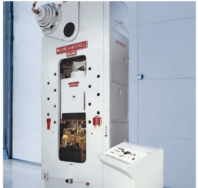
Modernization of Wilkins & Mitchell press.

Test rigs for power press clutch & brake testing are set up in our workshop ready to receive customers' clutch & brake units for insurance testing or testing following repairs or refurbishments.