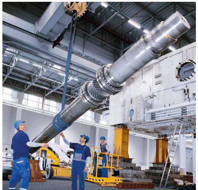
Spare part handling.