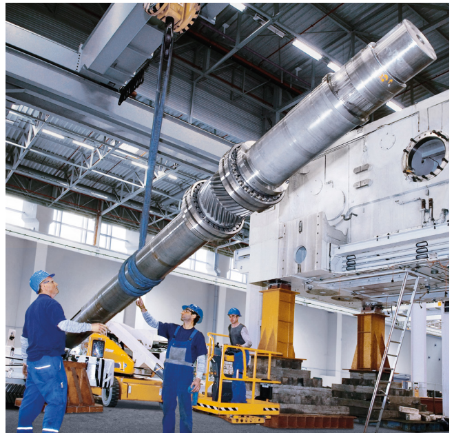
Spare part handling.