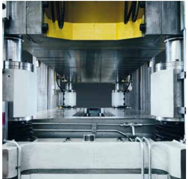
Die space. Depth penetration control and slide guidance guarantee high part quality.

Schuler supplies the complete system with coil line, feed and blank stacker which are linked together by a uniform control and visualization system. These integrated components ensure a consistent high level of availability from your production system so that operation, maintenance, setup and die changes are significantly simplified.