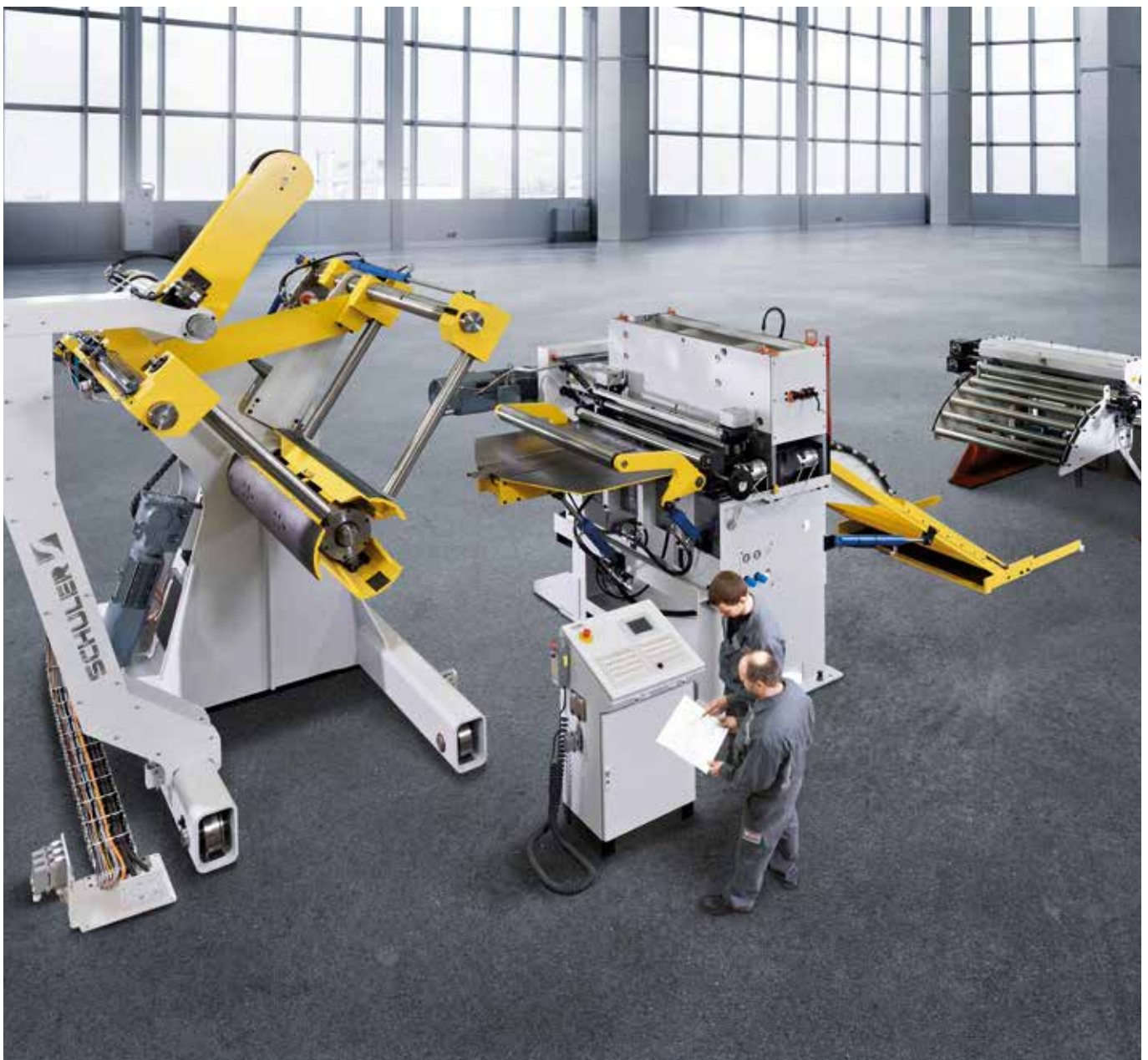
Power Line coil feeding lines are well suited to supporting highly dynamic production processes.

Schuler's Power Line coil feeding lines have been specially developed to meet the needs of customers in the supplier sector. The product range comprises various high-performance basic models of our coil lines which are suitable for all press types.