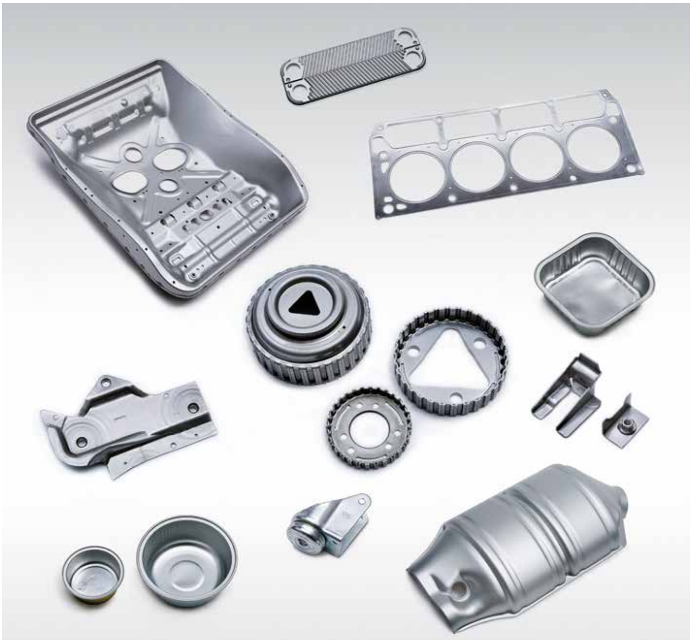
Power Line coil feeding lines cover a broad spectrum of parts.

Power Line coil lines are ideally suited for the production of structural parts and laminations for electric motors. They are also ideal for manufacturing parts using materials with a sensitive surface, such as sinks and stove tops.