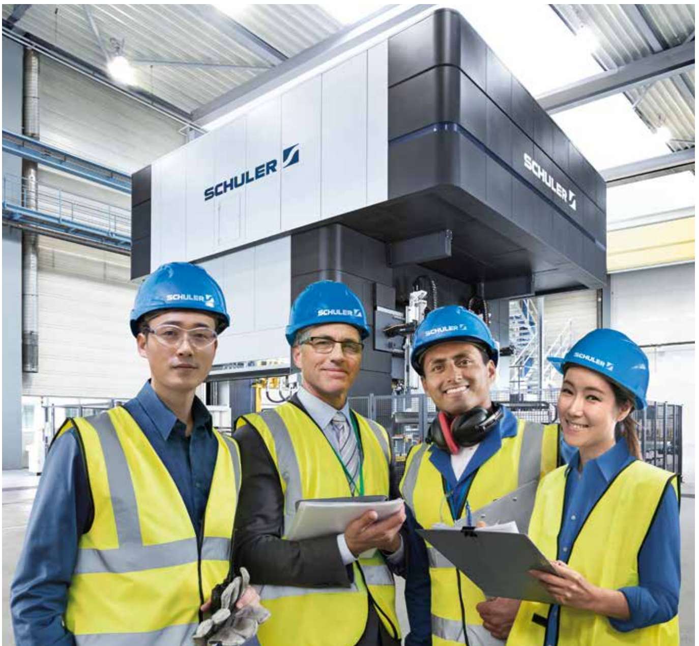
Schuler Service – Customer-oriented & efficient, worldwide.

Schuler Service offers a tailored portfolio of services covering the entire life cycle of your equipment.