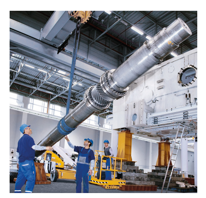
Spare part handling.