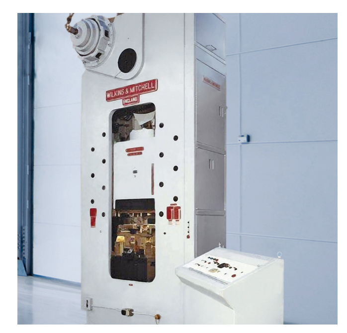
Modernization of Wilkins & Mitchell press.

Test rigs for power press clutch & brake testing are set up in our workshop ready to receive customers' clutch & brake units for insurance testing or testing following repairs or refurbishments.