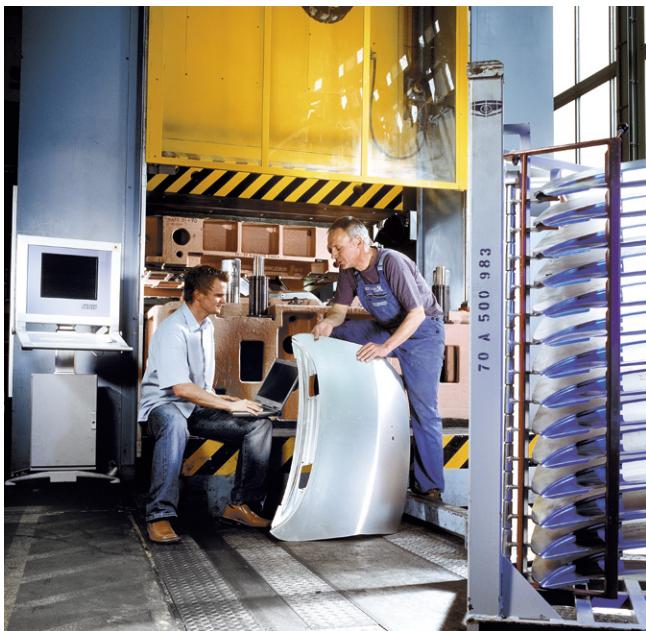
Hydraulic tryout presses reduce costly downtimes.

Hydraulic multi-point bed cushions. In order to use tryout presses universally, a hydraulic press cushion is needed in the press bed. This is designed to optimally cover the wide range of cushion technologies used in today's production processes.