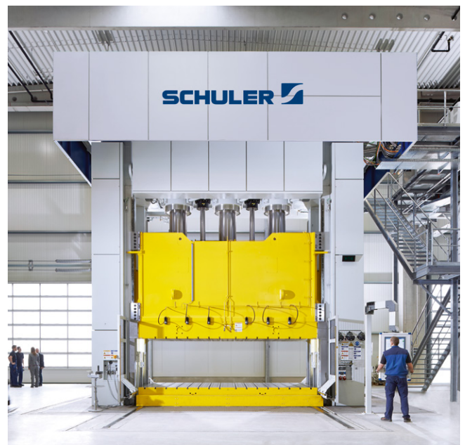
Hydraulic tryout presses enable quick tryout for draw dies.

Multicurve drive. To improve tryout results for dies on mechanical presses, various slide kinematics can be simulated using the multicurve drive. These simply need to be entered once and saved. Data can be easily imported. For precise simulation of the forming process on mechanical and servo-mechanical production plants, the hydraulic multicurve tryout press can reach operating speeds of up to 500 mm/sec. The hydraulic multi-point drawing cushions in the press bed also simulate the functions of the drawing cushions on modern production equipment and ensure near-production tryout conditions.