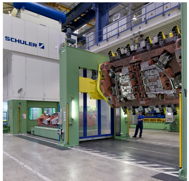
Die openers for ergonomic machining of the upper die.