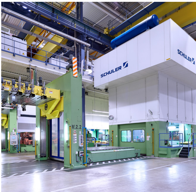
Tryout centers make the die tryout process highly efficient.

Tryout centers offer the ultimate in flexibility when it comes to die engineering and press plants. Depending on requirements, they include various hydraulic or mechanical press types and die openers.