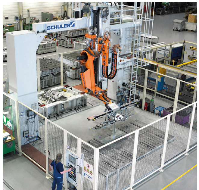
Optimization of parts transport reduces the tryout time on the production line.