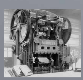
Auto body panel press.