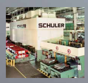
Transfer press with tri-axis transfer.