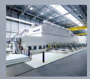
Press line with ServoDirect Technology.