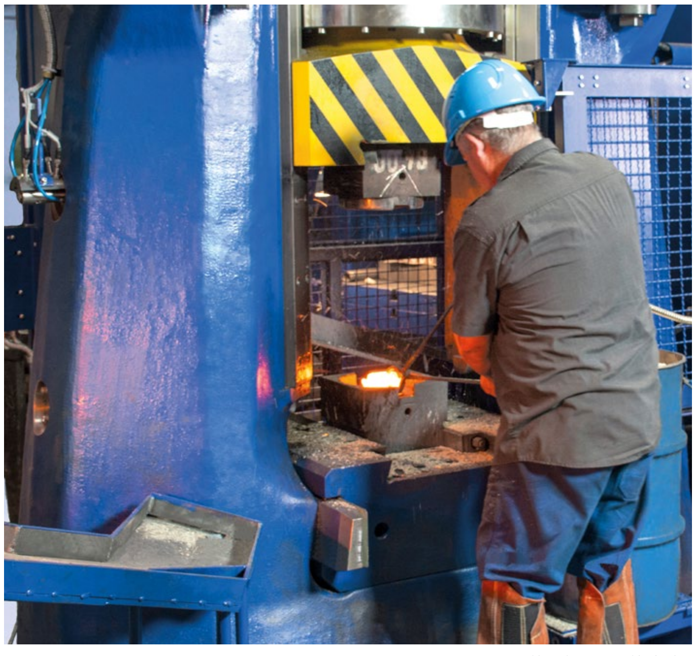
Linear hammer used for forging.