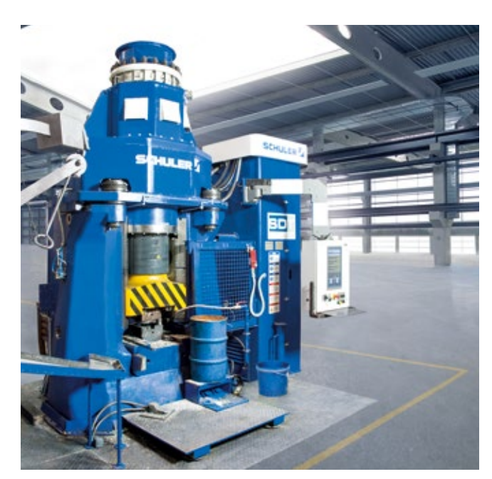
Linear hammer with ServoDirect technology.

This means that the reject rate is reduced considerably, even at a lower impact energy. Perfectly complemented by the non-contact, zero-maintenance linear drive, which directly converts electrical energy into the mechanical movement of the tup, average energy savings of up to 25% can be achieved in comparison to hydraulic hammers.