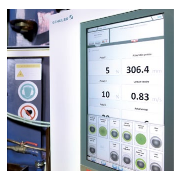
Operating the press via the touchscreen is intuitive and user-friendly.

Well informed. The ServoDirect drive of the linear hammer enables various pieces of process data to be continually recorded, such as distance and speed curves. Such data can be exported for optimization and processing in production data acquisition systems.