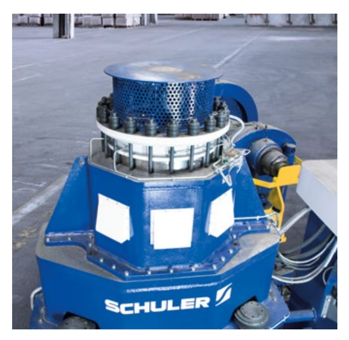
Maintenance-free drive head.