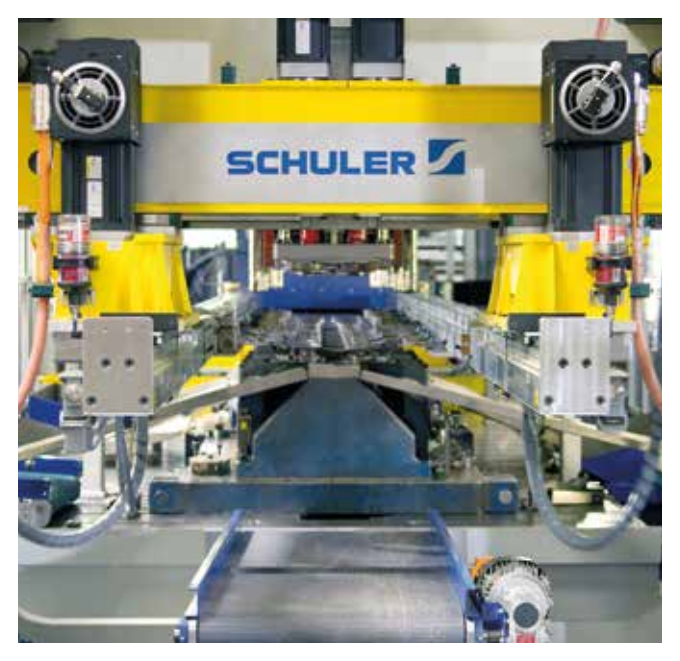
Reliable part transfer and high output performance with Schuler's transfer solutions.

The new modular transfer generation is designed in three basic sizes, covering a wide range of applications. This is a high-performance supplement for presses used in sheet metal forming.