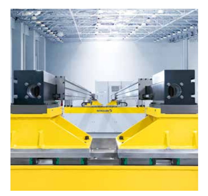
Compact and a genuine alternative to progressive die manufacturing: the Schuler Intra Trans.

There are no restrictions to access the die or the die change process. The operation of the transfer systems of Schuler's Pro Trans and Power Trans lines is the same.